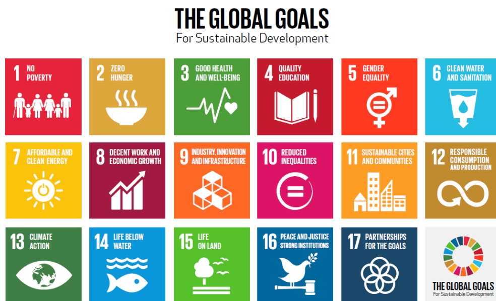
Figure 1: UN Graphical Illustration of the 17 SDGs

rights and equality, preservation of cultural identity, respect for cultural diversity, race and religion, and economic sustainability necessary to maintain the natural, social and human capital required for income and living standards (Klarin, 2018). Sustainable development goals are summarised in the figure 1: